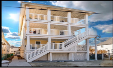
138 E YOUNGS WILDWOOD, NJ Penthouse Unit 3