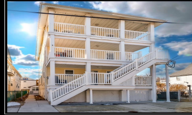
138 E YOUNGS WILDWOOD, NJ Penthouse Unit 3