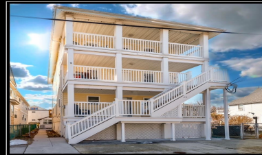
138 E YOUNGS WILDWOOD, NJ Penthouse Unit 3