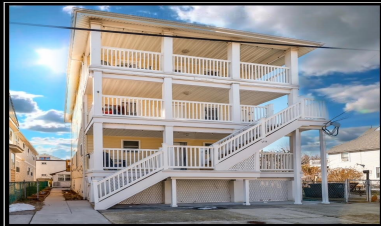
138 E YOUNGS WILDWOOD, NJ Penthouse Unit 3