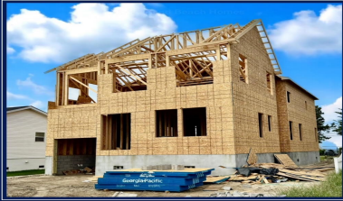
NEW CONSTRUCTION 5 BEDROOM WITH POOL Mid/Late Summer Delivery