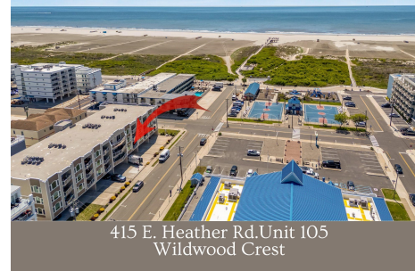
415 E. Heather Rd, Unit 105 Wildwood Crest