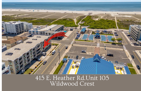
415 E. Heather Rd, Unit 105 Wildwood Crest