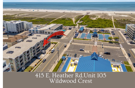
415 E. Heather Rd, Unit 105 Wildwood Crest