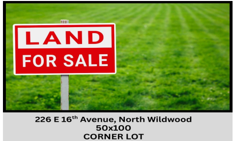
Bedrooms 0 Baths Full 0 Baths Half Year Built Vacant Lot Type 235 Block Number Listing # 251068