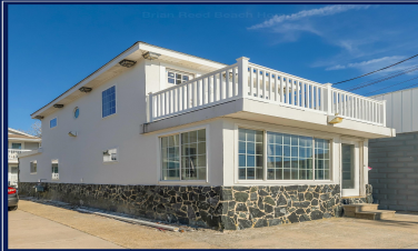
123 E Lincoln Avenue Wildwood, NJ 3 Bedroom 2 Bath Single Family