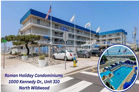
Roman Holiday Condominiums 1000 Kennedy Dr., Unit 310 North Wildwood