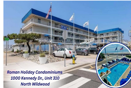
Roman Holiday Condominiums 1000 Kennedy Dr., Unit 310 North Wildwood