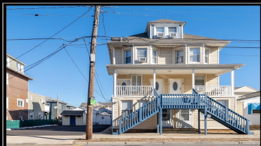
107 e Magnolia Wildwood, NJ 2 Bedroom Condo