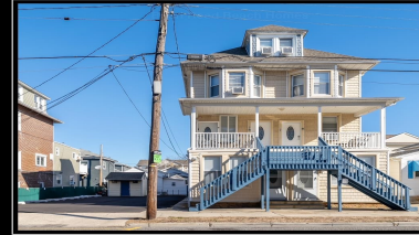
107 e Magnolia Wildwood, NJ 2 Bedroom Condo