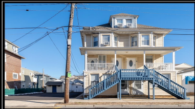
107 e Magnolia Wildwood, NJ 2 Bedroom Condo