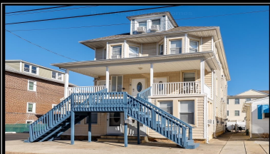
107 E Magnolia Avenue Wildwood, NJ 1st Floor 1 Bedroom Condo