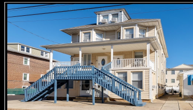
107 E Magnolia Avenue Wildwood, NJ 1st Floor 1 Bedroom Condo