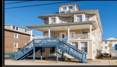
107 E Magnolia Avenue Wildwood, NJ 1st Floor 1 Bedroom Condo