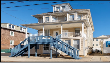
107 E Magnolia Avenue Wildwood, NJ 1st Floor 1 Bedroom Condo