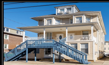
107 E Magnolia Wildwood NJ 6 Bedroom Townhouse