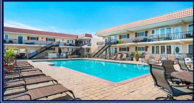
208 E 25TH AVENUE #201 NORTH WILDWOOD The Heritage Condominiums