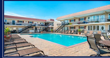
208 E 25TH AVENUE #201 NORTH WILDWOOD The Heritage Condominiums