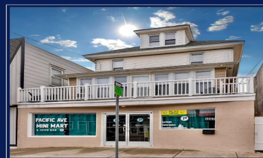
4 BEDROOM TOWNHOUSE AND STOREFRONT 3007 Pacific Avenue Wildwood, NJ