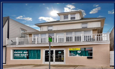
4 BEDROOM TOWNHOUSE AND STOREFRONT 3007 Pacific Avenue Wildwood, NJ