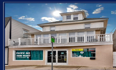
4 BEDROOM TOWNHOUSE AND STOREFRONT 3007 Pacific Avenue Wildwood, NJ