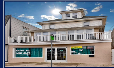
4 BEDROOM TOWNHOUSE AND STOREFRONT 3007 Pacific Avenue Wildwood, NJ