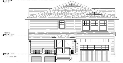
1 FRONT ELEVATION A4.1