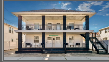
238 E Leaming Avenue #6 Wildwood, NJ