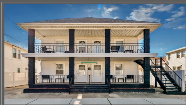
238 E Leaming Avenue #6 Wildwood, NJ