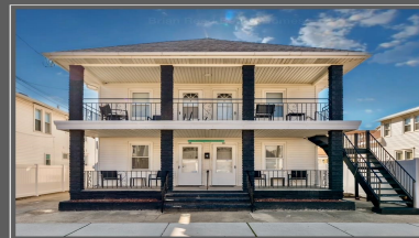
238 E Leaming Avenue #6 Wildwood, NJ