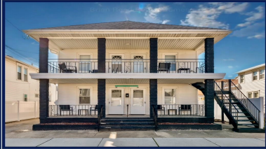
238 E Leaming Avenue # 5 Wildwood, NJ