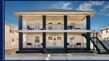
238 E Leaming Avenue # 5 Wildwood, NJ