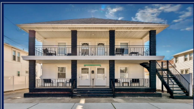
238 E Leaming Avenue # 5 Wildwood, NJ