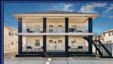
238 E Leaming Avenue # 5 Wildwood, NJ