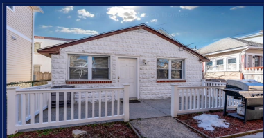
138 E Youngs Ave Wildwood, NJ Rear Cottage