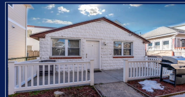
138 E Youngs Ave Wildwood, NJ Rear Cottage