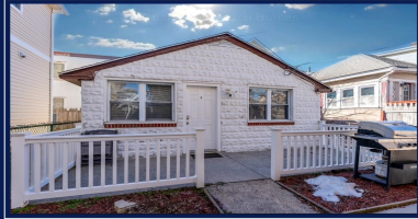
138 E Youngs Ave Wildwood, NJ Rear Cottage