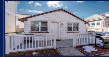
138 E Youngs Ave Wildwood, NJ Rear Cottage