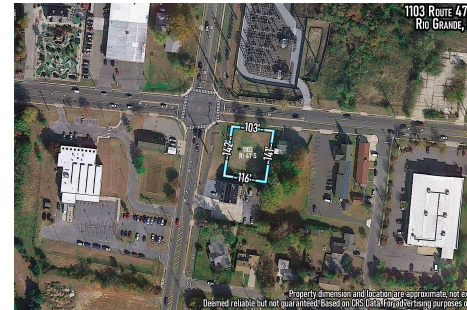
1103 Route 47 S, Rio Grande, NJ