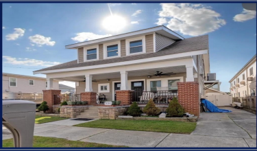
220 E 21ST AVENUE North Wildwood, NJ 8 Bedroom Duplex