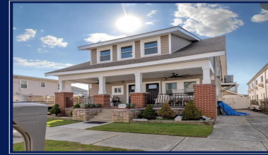
220 E 21ST AVENUE North Wildwood, NJ 8 Bedroom Duplex