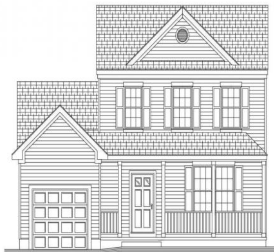
STOCKTON MODEL ELEVATION