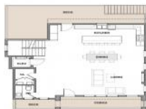
1 FIRST FLOOR PLAN