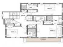
1 SECOND FLOOR PLAN