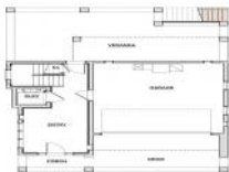
1 GROUND FLOOR PLAN