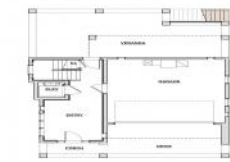
1 GROUND FLOOR PLAN