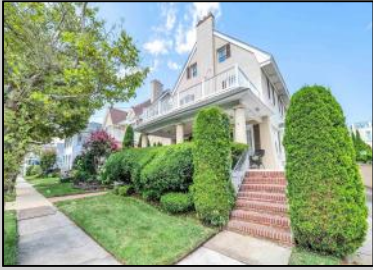
15 New Haven Ventnor, NJ 08406