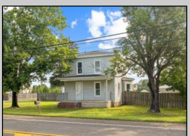
1431 RT 50 Tuckahoe, NJ 08250