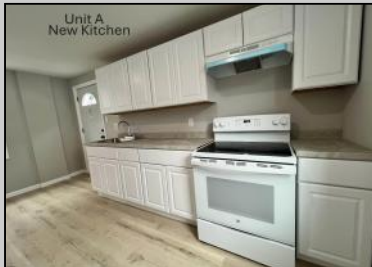
Unit A New Kitchen