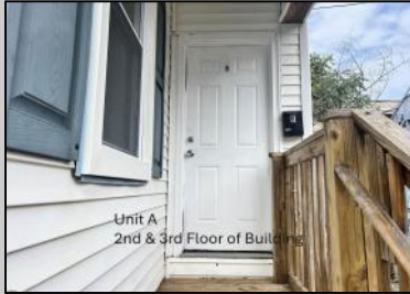
Unit A 2nd & 3rd Floor of Building