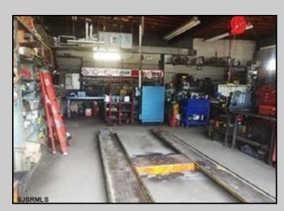
2320 New Rd Northfield, NJ 08225