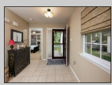
76 Gasko Mays Landing, NJ 08330