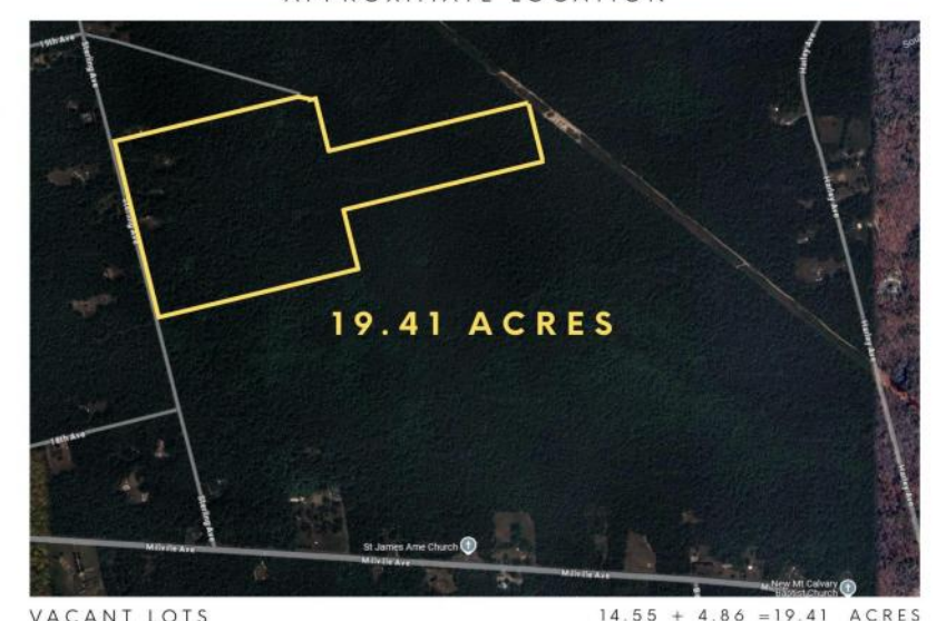
the information provided is for informational purposes only and should not be relied upon as legal, financial, or real estate advice. All ma pinpoints, and location indicators are approximate and intended for general reference only. The sellers and their agent make no guarante warranties, or representations, expressed or implied, as to the accuracy or completeness of this information. Buyers are encouraged to cond heir own independent investigations to verify all details.