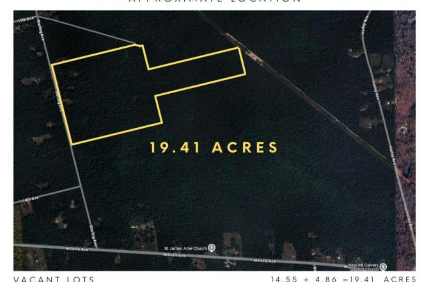
he information provided is for informational purposes only and should not be relied upon as legal, financial, or real estate advice. All maps pinpoints, and location indicators are approximate and intended for general reference only. The sellers and their agent make no guarantees varranties, or representations, expressed or implied, as to the accuracy or completeness of this information. Buyers are encouraged to conduc heir own independent investigations to verify all details.