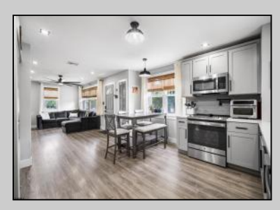
1650 Buerger St Egg Harbor City, NJ 08215