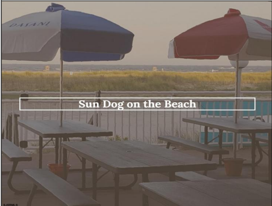
Sun Dog on the Beach