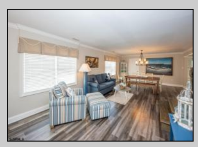
8 Valmar Court Ocean City, NJ 08226