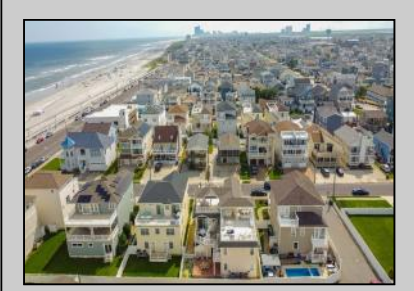
235 14th #B Brigantine, NJ 08203