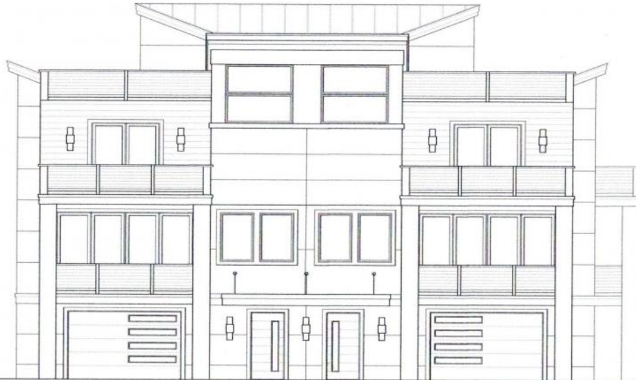
NEWARK AVENUE ELEVATION