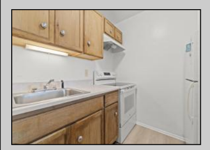
106 Newtowne Sq Pleasantville, NJ 08232