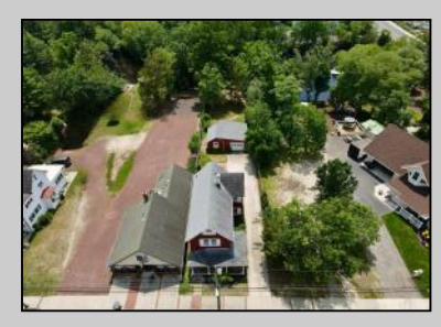
6068 Main Mays Landing, NJ 08330