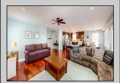
826 Second Ocean City, NJ 08226