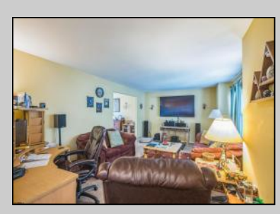
111 Spray ave Egg Harbor Township, NJ 08234