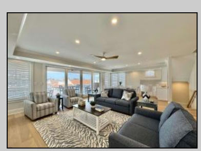
905 St James Ocean City, NJ 08226