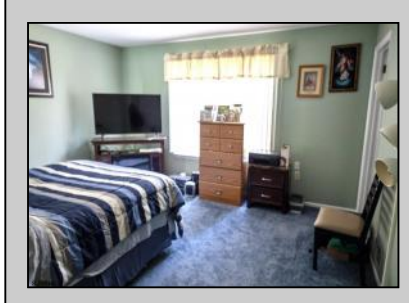
143 Valley Forge Dr Little Egg Harbor, NJ 08087