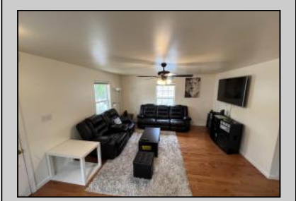
132 Brighton Pleasantville, NJ 08232