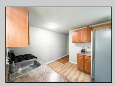
27 Bellevue Ave Atlantic City, NJ 08401